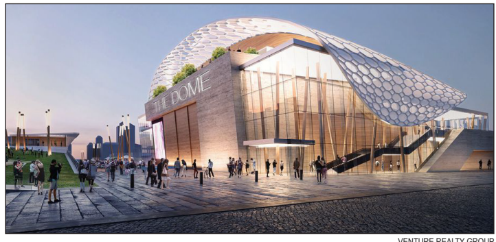
The City Council voted Nov. 19 to approve a development agreement to build the Atlantic Park surf project at the former Dome site.

Resort action plan The Resort Area Strategic Action Plan (RASAP) planning process is nearing completion after a final draft review on Dec. 4. The final version is scheduled to go to the