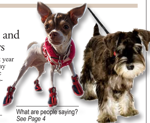
What are people saying? See Page 4