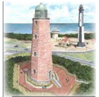
Cape Henry Lighthouse has reopened. Story, Page 3