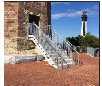
DON NADEN | NVBCL

The dune restoration included brick pavers to provide a finished surface to the pedestrian plaza.